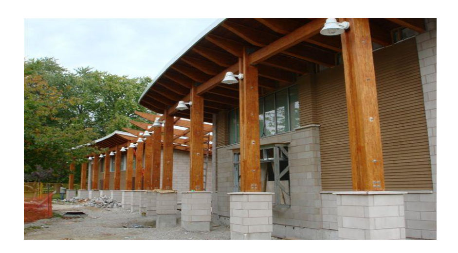
Client: Project Name: Location: Project Value: Date:

Town of Oakville Tannery and Coronation Park Pavilions Tannery Road and Lakeshore Road, Oakville, Ontario $ 1,700,000.00 November 2009 to April 2011